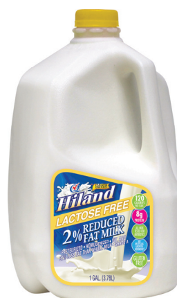
Lactose Free 2% Reduced Fat Milk

INGREDIENTS: MILK, LACTASE ENZYME* AND VITAMIN D3. CONTAINS: MILK *NOT FOUND IN REGULAR MILK.