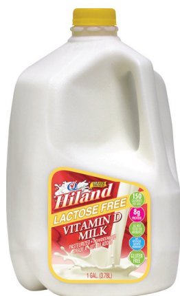
Lactose Free Vitamin D Milk