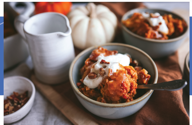
Pumpkin Pie Bread Pudding

Have a store that wants to get involved? We can provide customized point-of-sale materials.