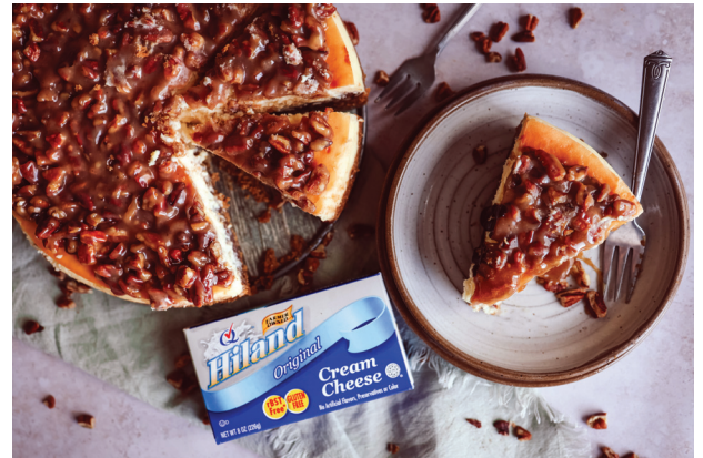
Pecan Pie Cheesecake